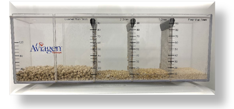
Figure 1 Shaker Sieve

It is important to understand the physical quality of feed in the field. This can be assessed by determining the size of the feed particles presented to the birds by use of a shaker sieve. This device shown in Figure 1 can help the farmer or service person define the size distribution of pellets or crumbles. This method of measuring physical feed quality will provide a quantitative comparison between feed deliveries or flocks.